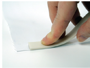
Stick to fabric