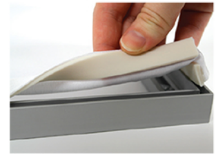
Remove/Replace as needed