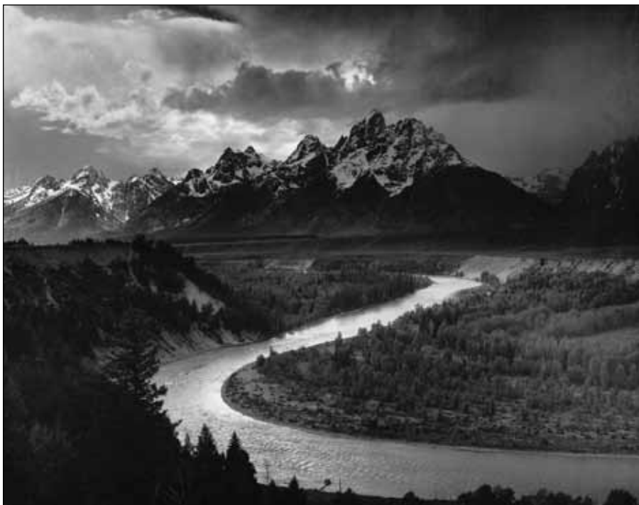
Concerned industry members should recall that legendary American scenic photographer Ansel Adams used fiber papers containing OBAs in the 1970s for his photographic prints.